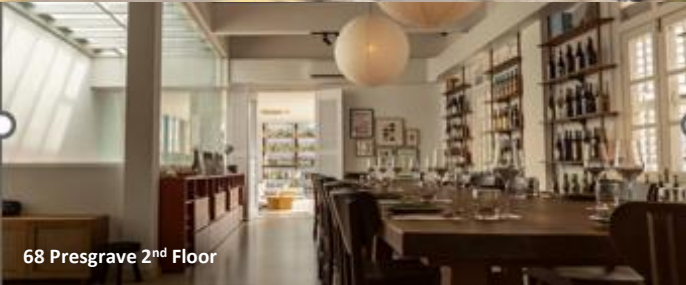
68 Presgrave 2 nd Floor