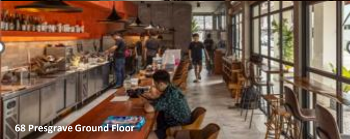
68 Presgrave Ground Floor