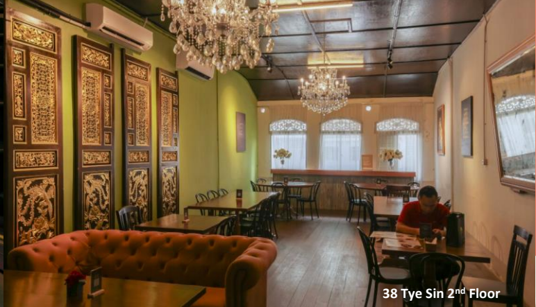
38 Tye Sin 2 nd Floor