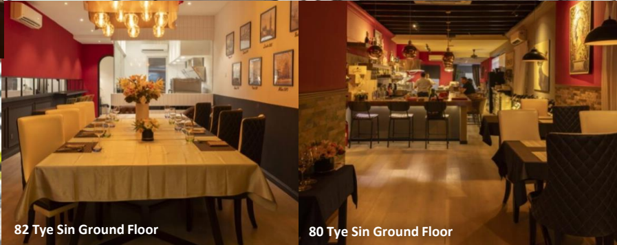
82 Tye Sin Ground Floor