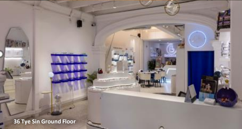
36 Tye Sin Ground Floor