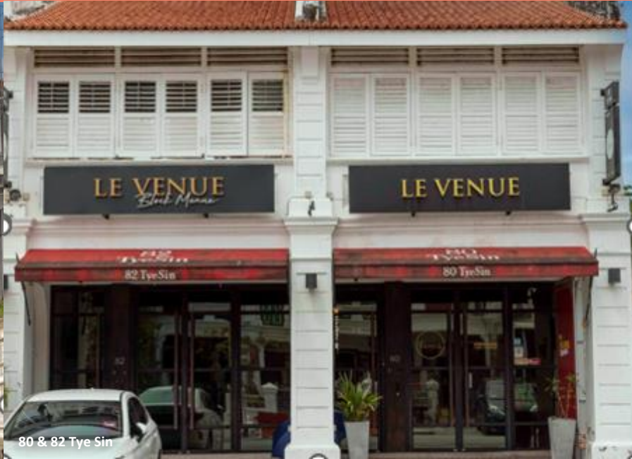
80 & 82 Tye Sin