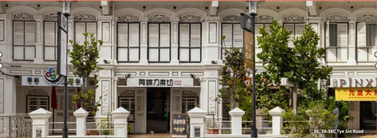
36, 38-38C Tye Sin Road