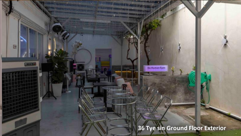
36 Tye sin Ground Floor Exterior