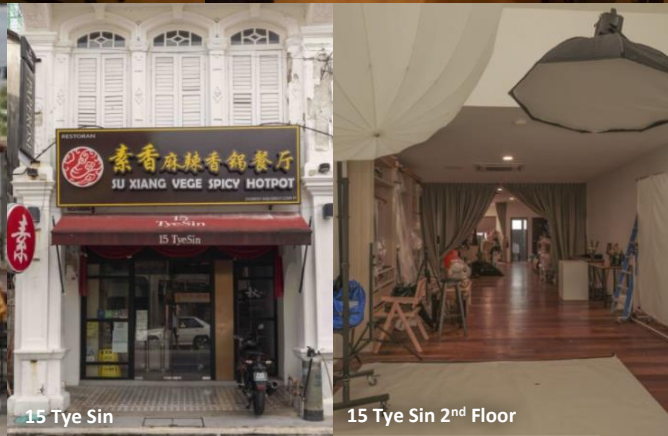
15 Tye Sin