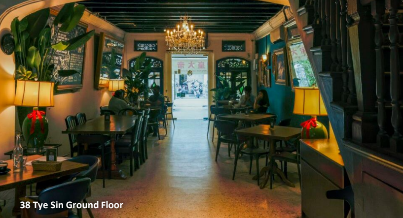
38 Tye Sin Ground Floor